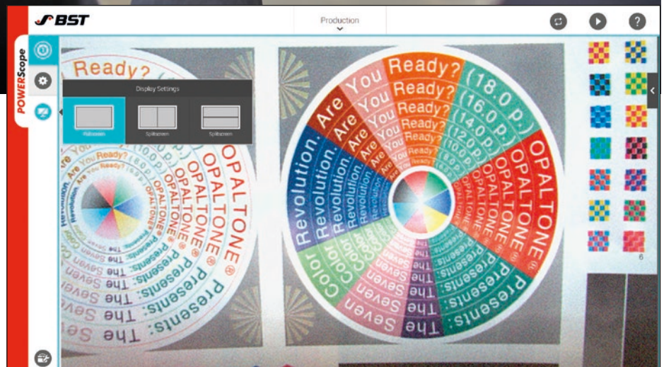
The intuitive POWERScope 5000 touch screen user interface "Production Display Settings Menu".