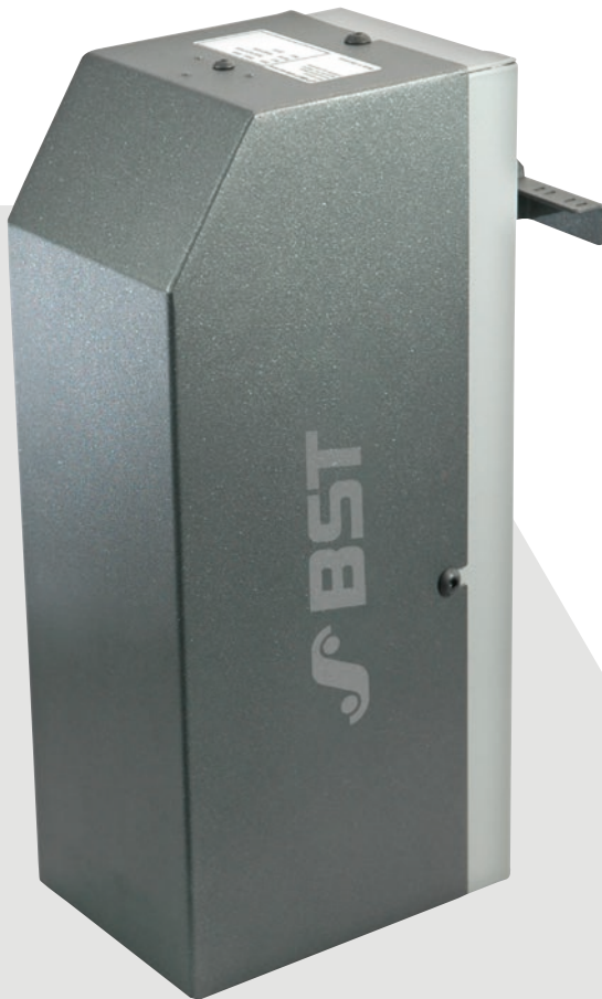
Camera unit of the POWERScope 5000

High-performance video technology for flawless print results: Only providers who carry out printing processes quickly, without any major waste and downtimes and with the maximum degree of consistent quality can remain competitive on today's market.